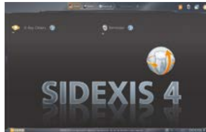
Customer project SIDEXIS 4 for Sirona, awarded for best communication design